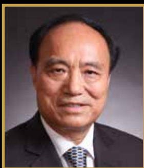
H.E. Mr. Houlin Zhao Secretary-General, International Telecommunications Union

"The SAMENA Leaders' Summit provides a unique platform for telecom industry stakeholders (operators, regulators, vendors and other advocacy bodies) in the region to share their collective views on the strategic direction of the industry - against the backdrop of macroeconomic pressures, highly competitive markets, digital transformation and innovation. I have found the sessions to be both instructive and insightful, enriched through impactful presentations and discussions on a variety of topics ranging from the need for greater industry-wide collaboration to objective views on regulation to address the convergence of telecoms, media and digital services as well as forward-looking areas such as IoT. I am grateful to the SAMENA organization and its impressive team that has made it all possible."