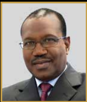
H.E. Dr. Hamadoun I. Touré Executive Director, Smart Africa

"As a founding member in 2006, STC is proud to have played an integral role over the past 10-years in evolving and transforming SAMENA into a truly relevant organization for its members and stakeholders. With its ever-increasing global influence and effectiveness in interacting and coordinating with other relevant global fora, I strongly believe that SAMENA is playing a critical role in promoting and supporting the development of Telecoms and ICT, and presenting a unified voice towards the socio-economic development of the SAMENA region."