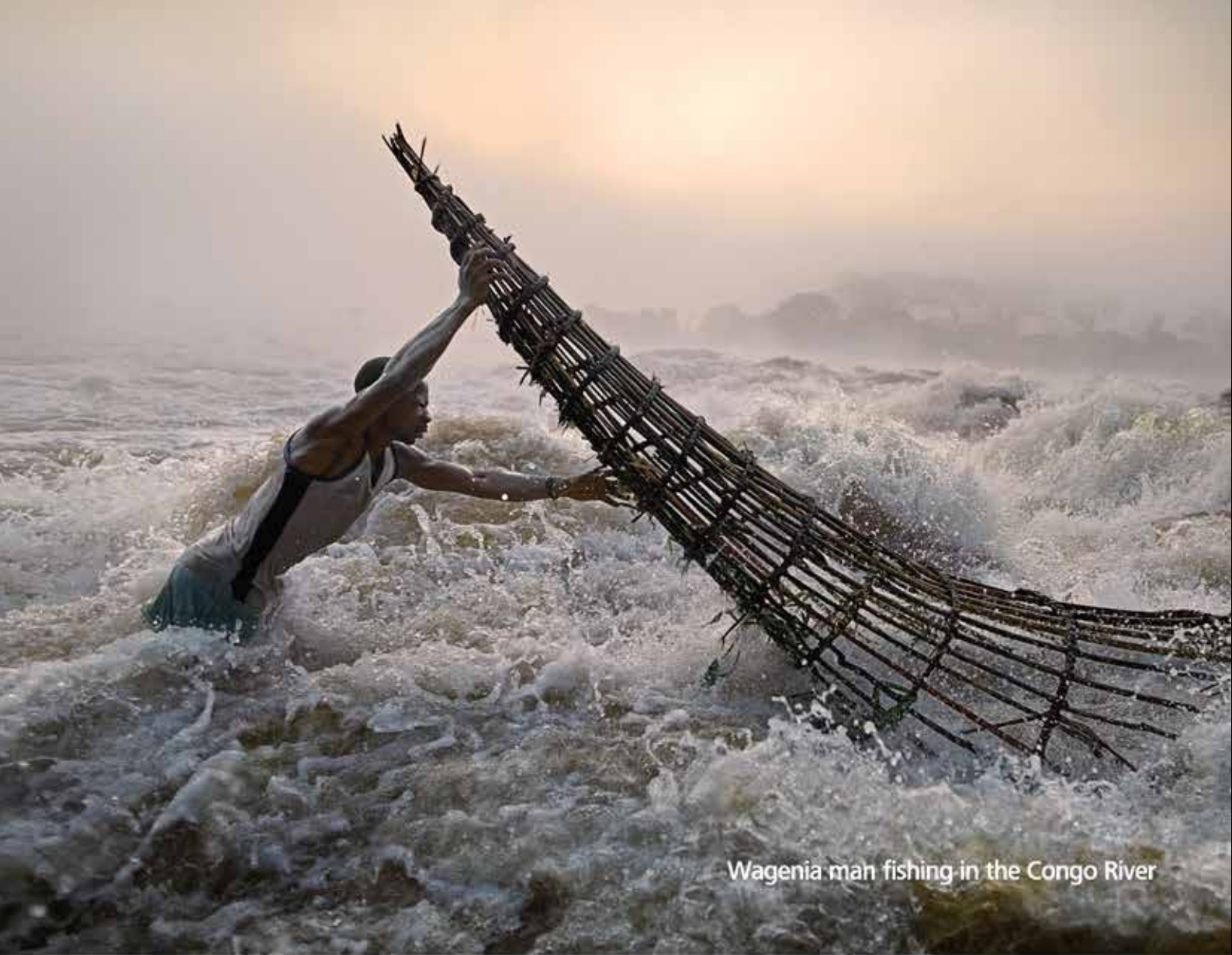
Wagenia man fishing in the Congo River

Tireless focus, for a moment of strategic opportunity